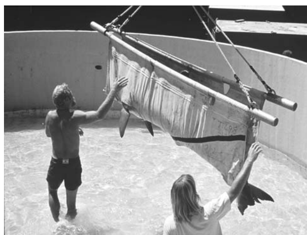
Fig. 1 The dolphin is lifted in a fleece-lined sling in preparation for the experiment

Eight dolphins employed in the study were all adult Tursiops truncatus that were healthy at the start of the study as determined by behavior, appetite, and clinical blood values (Ridgway et al. 1970). All animals were fasted 12 h overnight before the start of each study. The animals were taken from their seawater habitat in a fleece-lined transport sling (Fig. 1). They were placed on their sides on a soft rubber pad. An initial blood sample was taken from the central vessels of the fluke (Ridgway 1965). A standard 8–14 Fr clinical urinary catheter with inflatable cuff was inserted through the urethra into the urinary bladder. The cuff was inflated with 15–20 mL of sterile normal saline to retain the catheter in the bladder throughout the study. An initial